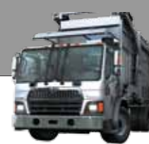
LoadStar w/ CW ISL-G