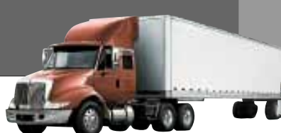
TranStar w/ ISL-G