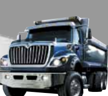
WorkStar w/ ISL-G