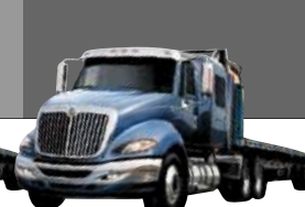
ProStar+ w/ MF 13 Diesel Injection