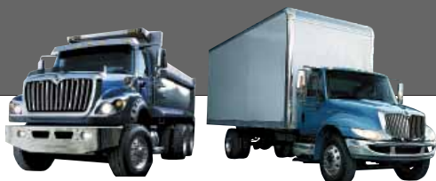
WorkStar w/ DT 466