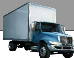
DuraStar w/ MF DT 466-G